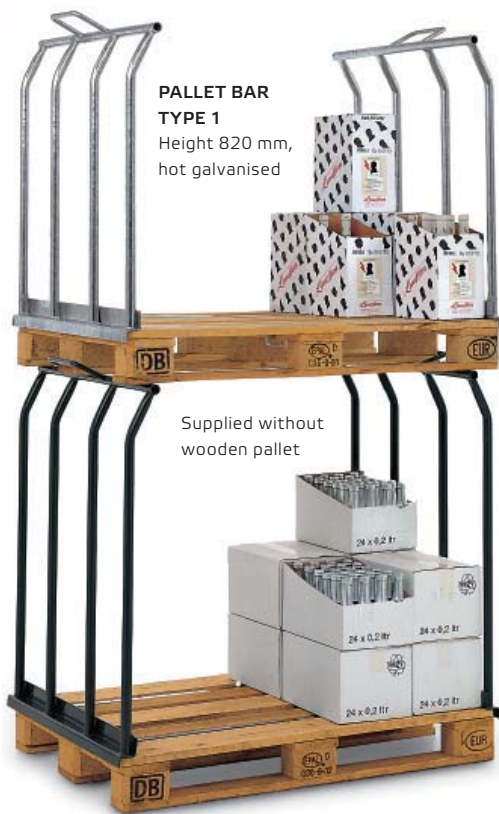
PALLET BAR TYPE 1 Height 820 mm, hot galvanised