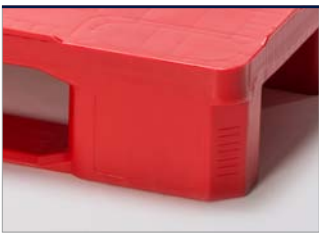
Special angle permitting easy stretch wrapping