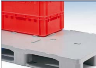
H1-GD version for E2 crates