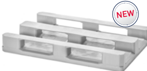
> 3 fully closed runners (3CR)