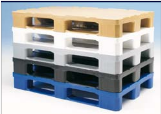
Several color options