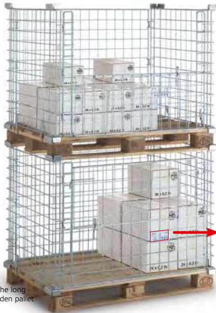
PA-X1/S Closing grate foldable on the long side, delivery without wooden pallet