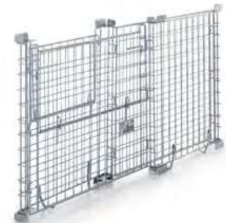
All models can be folded to save space.

SAFE HANDLING Clear information on load capacity and stacking shown directly on the box