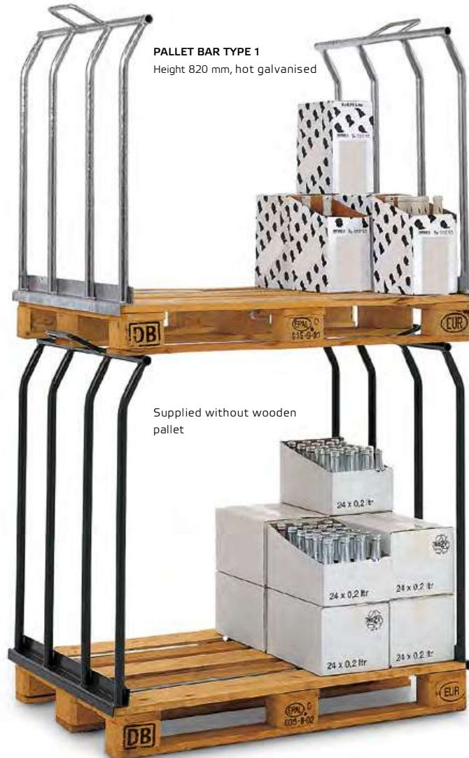
PALLET BAR TYPE 1 Height 820 mm, hot galvanised